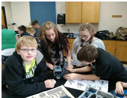
The 4-H After-School Robotics Club in Iosco County received a $1,000 Michigan 4-H Legacy Grant to use VEX Robotics as a tool to help club members develop life skills.

Learn more or apply online at http://mi4hfdtn.org/grants . Questions? Contact the Michigan 4-H Foundation at 517-353-6692.